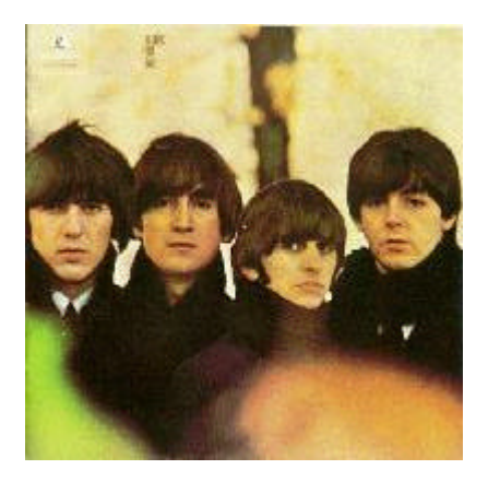
Beatles For Sale (Dezembro de 1964)

No Reply (Lennon/McCartney) Lead vocal: Lennon