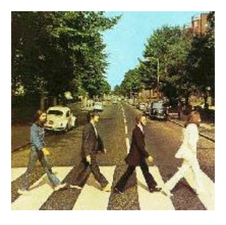
Abbey Road (Setembro de 1969)