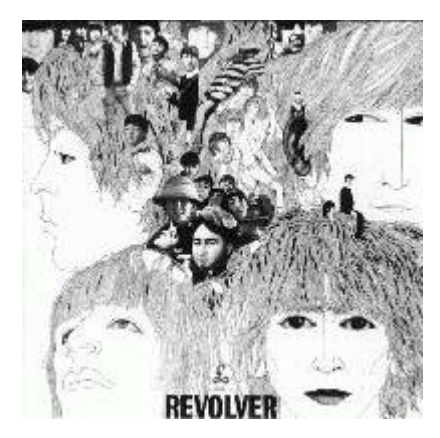
Revolver (Agosto de 1966)