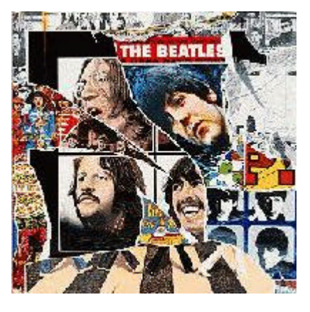
Anthology 3 (Outubro de 1996)