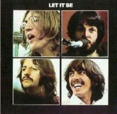
Let It Be (Maio de 1970)