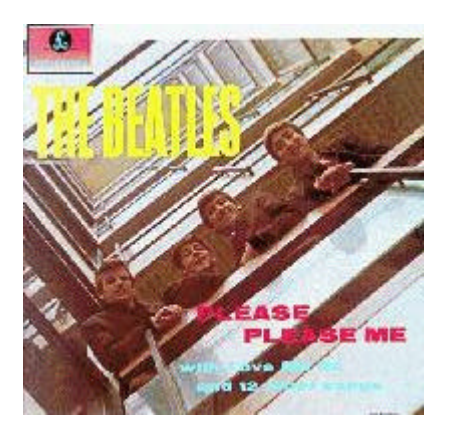
Please Please me (Março de 1963)

A música "pop" é um movimento contagiante, nos dias de hoje.